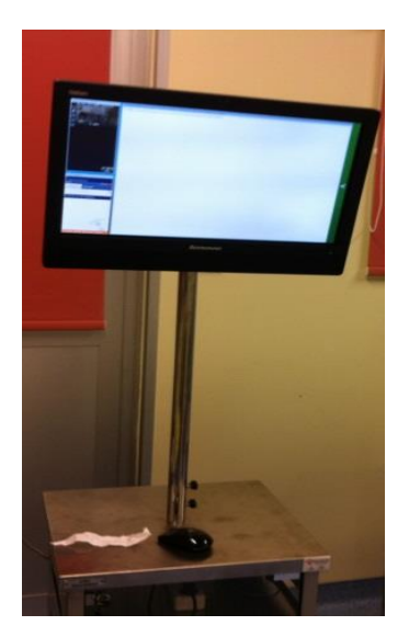
Figure 2: The station in the patient's home